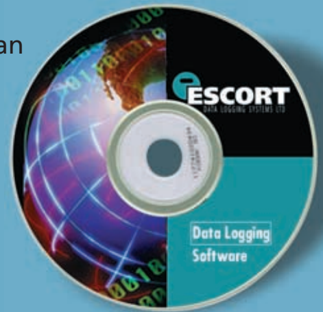
Easy-to-install Data Logging software