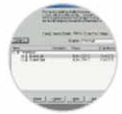
Step by step configuration process