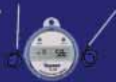
ESCORT iLog Temperature Logger with 2 external sensors