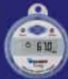
ESCORT iLog Humidity Logger