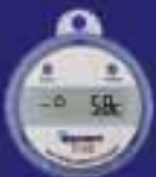
ESCORT iLog Temperature Logger